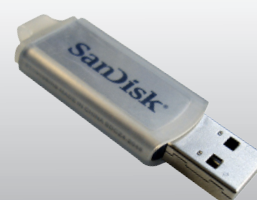
USB - DRIVE