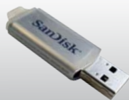
USB - DRIVE